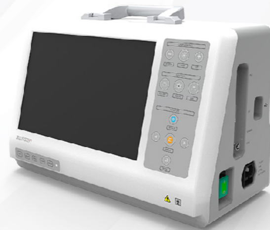
Imaging Processor PL-2000