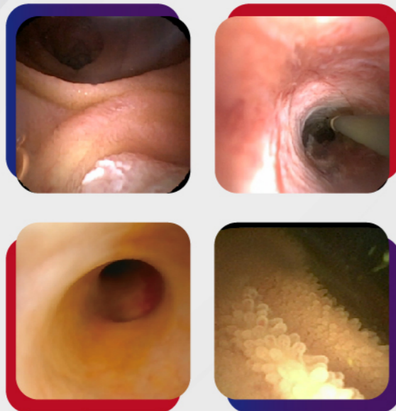
160K High resolution image