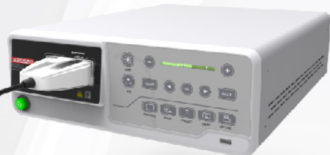
Imaging Processor PL-1000